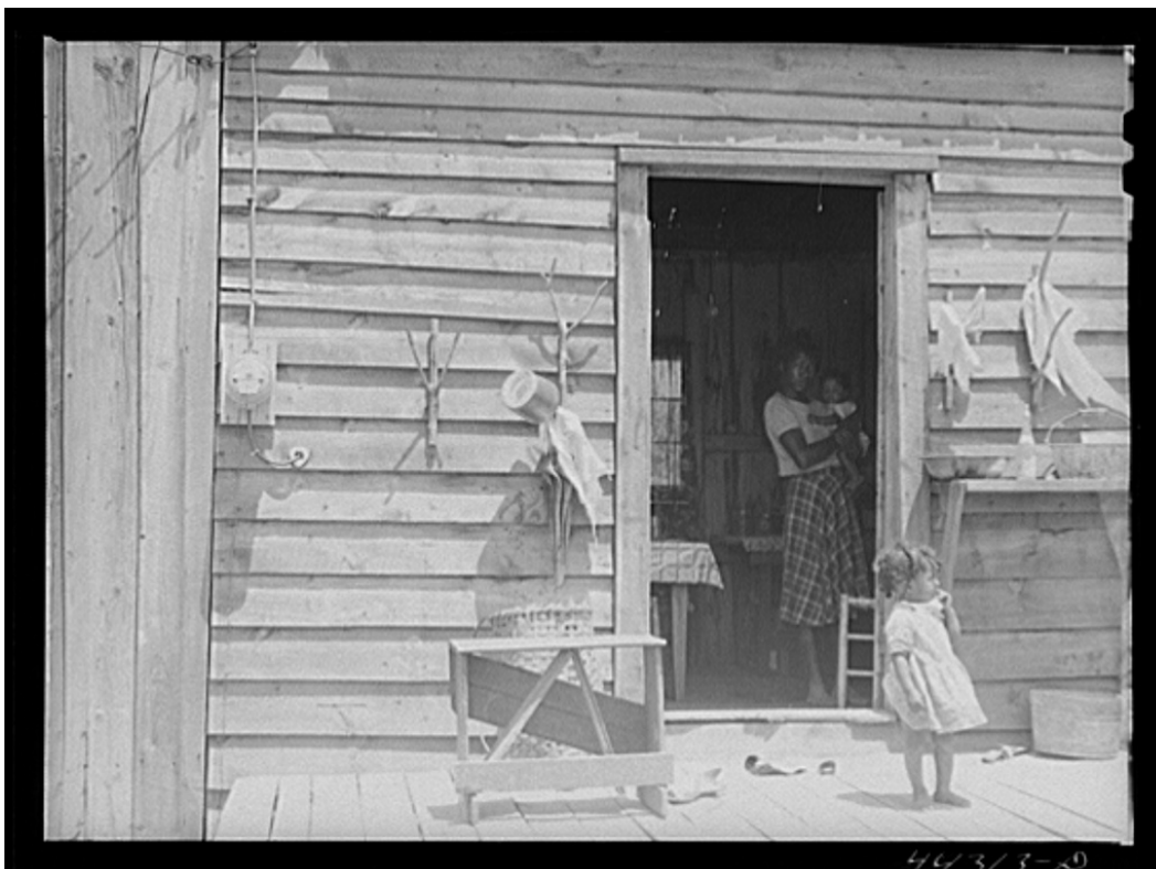
Negro tenant farmer's house showing REA Rural Electrification Administration electric meter on wall. Greene County, Georgia, United States, May 1941.