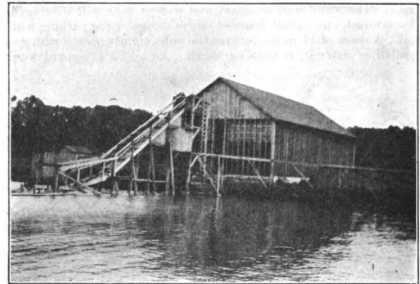
FIG. 4.—An ice house equipped with a mechanical hoist for filling.